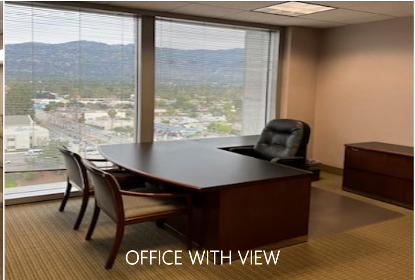
OFFICE WITH VIEW