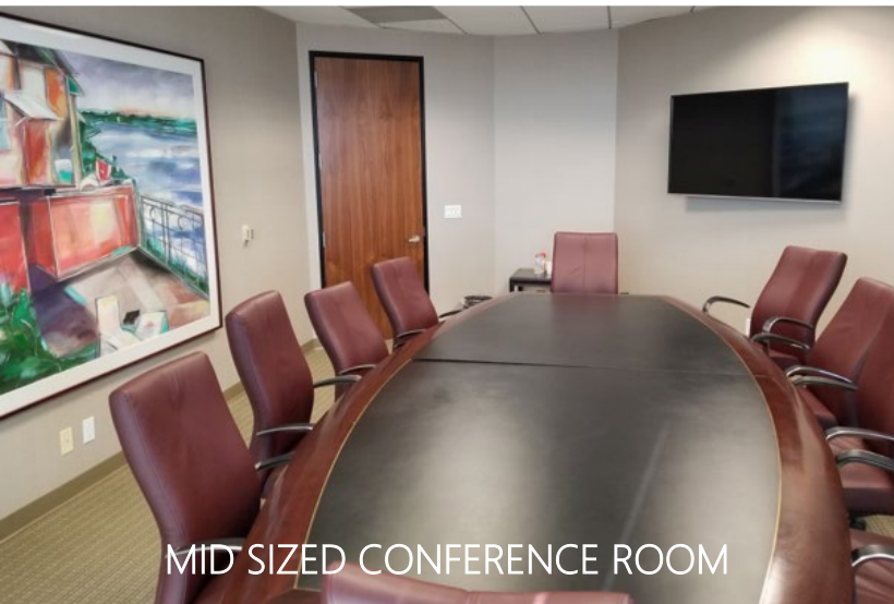
MID SIZED CONFERENCE ROOM