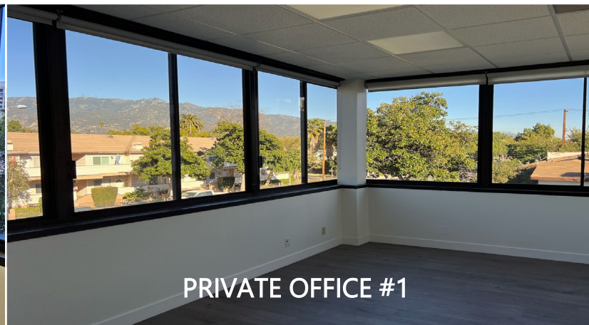
PRIVATE OFFICE #1