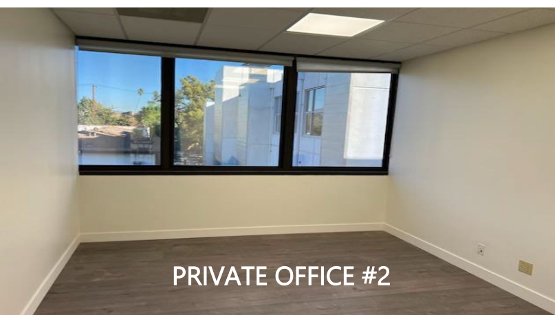
PRIVATE OFFICE #2