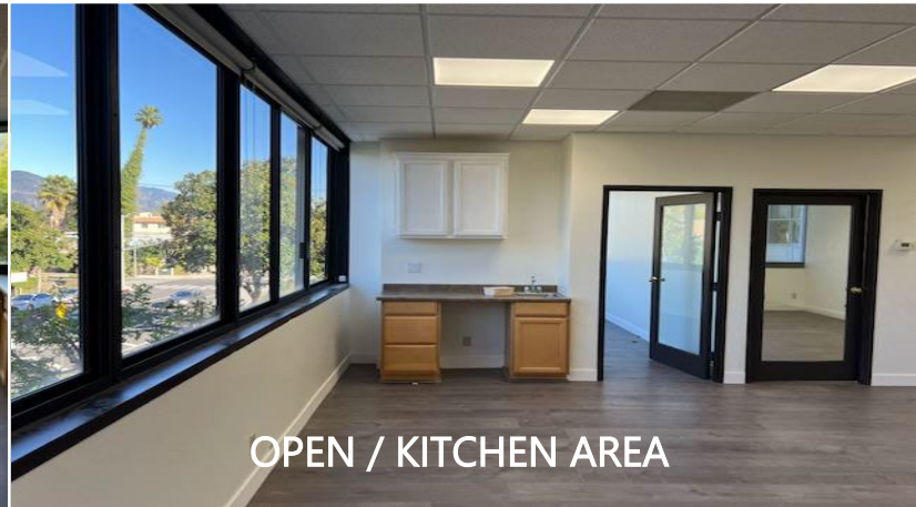
OPEN / KITCHEN AREA