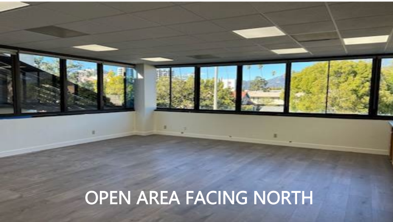
OPEN AREA FACING NORTH