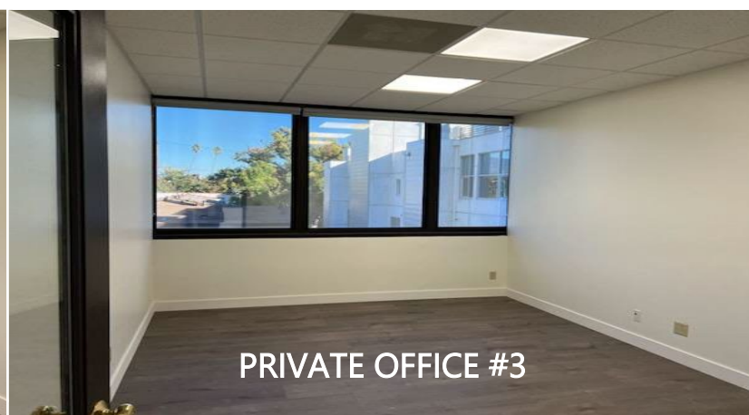
PRIVATE OFFICE #3