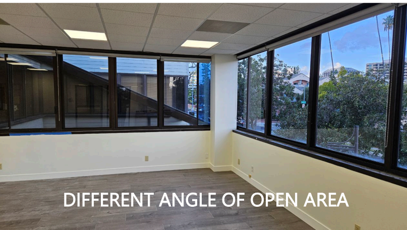
DIFFERENT ANGLE OF OPEN AREA