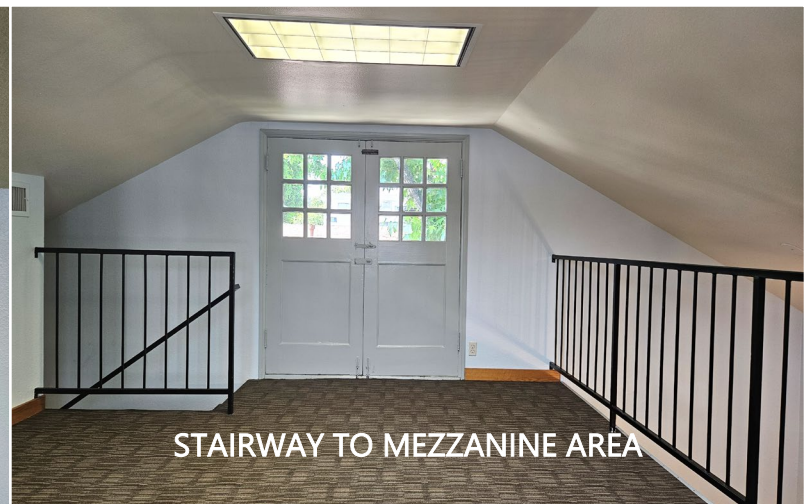
STAIRWAY TO MEZZANINE AREA