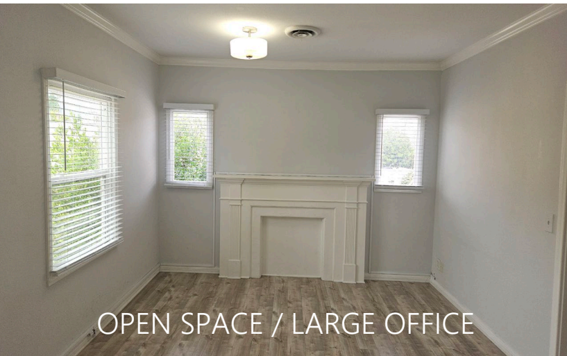
OPEN SPACE / LARGE OFFICE