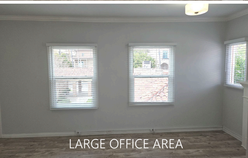
LARGE OFFICE AREA