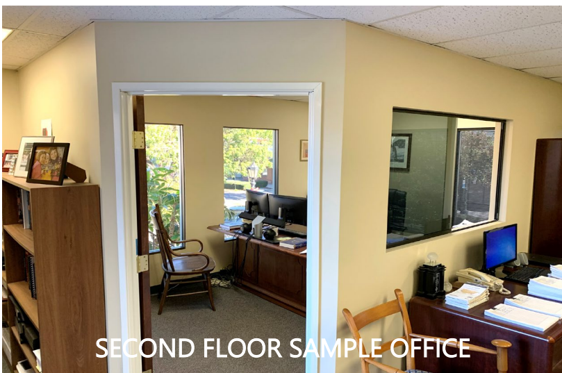
SECOND FLOOR SAMPLE OFFICE