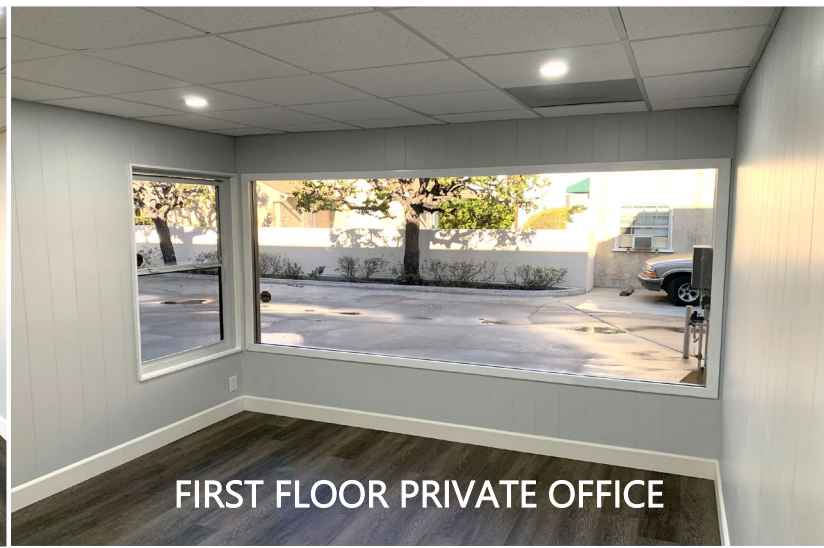
FIRST FLOOR PRIVATE OFFICE