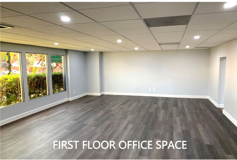
FIRST FLOOR OFFICE SPACE