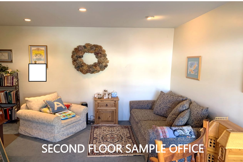
SECOND FLOOR SAMPLE OFFICE