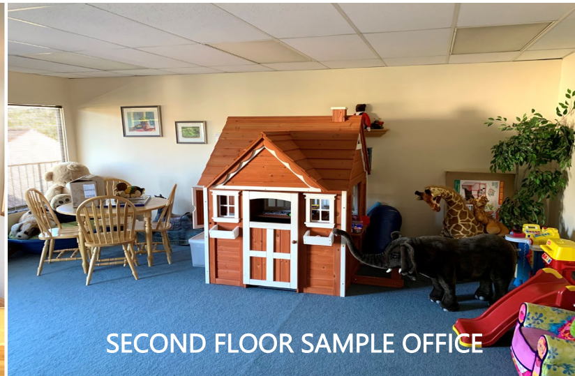
SECOND FLOOR SAMPLE OFFICE